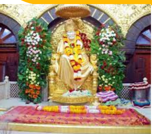
Shirdi Sai Baba